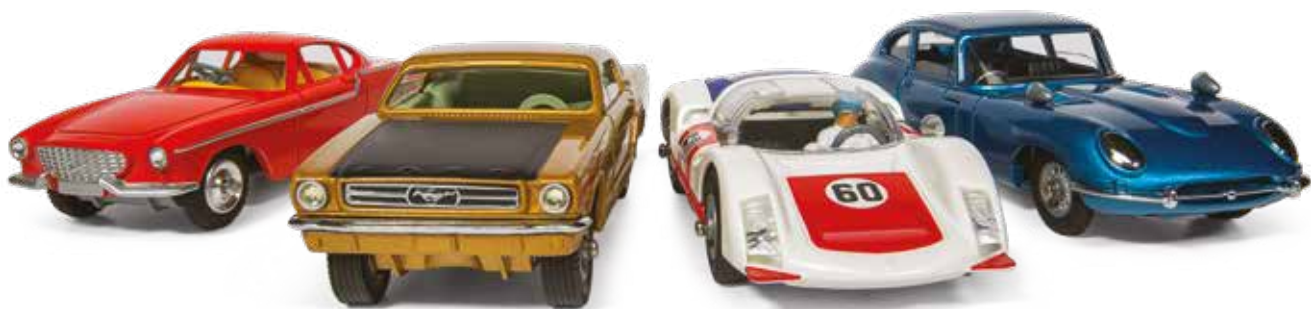
RT22801 Vintage CORGI® Toys Volvo P1800

New to the CORGI® range for 2023, some classics from our archives return as brand-new tooled models. Featuring rare colour options and reimagined recreation packaging, these first releases in the collection are perfect for CORGI® fans old and new, as well as gifting and collectors.