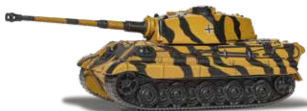
WT91301 World of Tanks T-34 Vs Panther