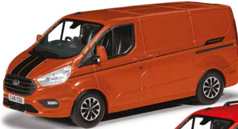
VA15101 Ford Transit Custom Sport Orange Glow

AVAILABLE NOW | Length 116mm | Limited Edition