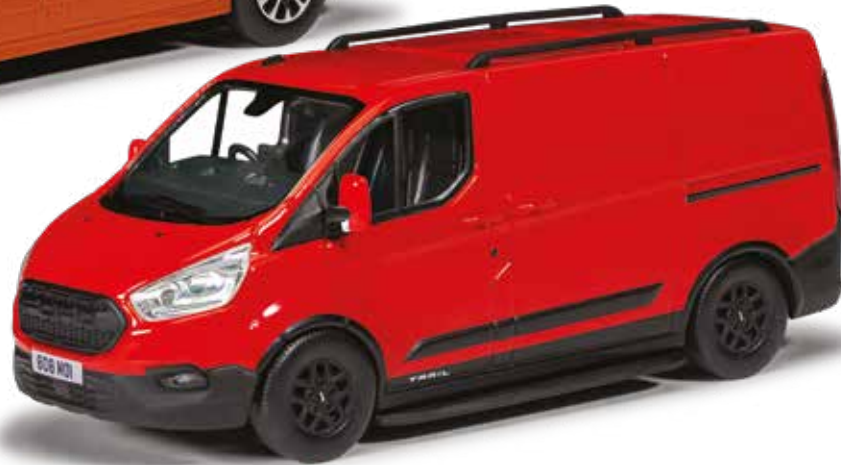
VA15102 Ford Transit Custom Trail 2.0 L1 H1 Race Red

Loved by Tradesmen and businesses alike, the Ford Transit Custom is renowned for its toughness, functionality and reliability. This first model represents a top of the range Custom Sport model.