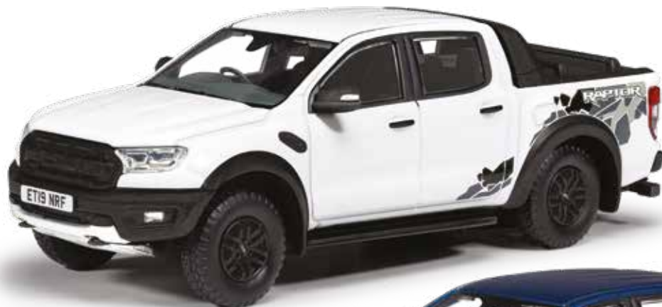
VA15203 Ford Ranger Raptor Frozen White

NEW TOOL | Length 126mm | Limited Edition