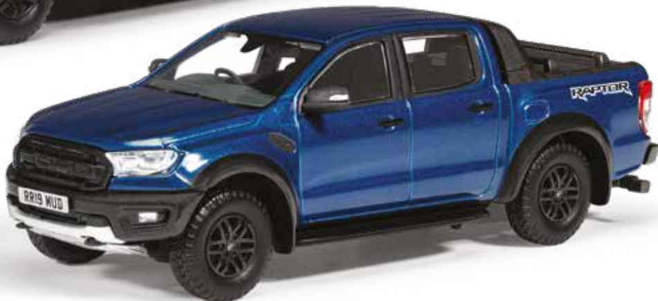
VA15201 Ford Ranger Raptor Special Edition Performance Blue

The Ranger Raptor was developed by Ford Performance, famous for cars wearing the RS badge. The vehicle modelled was the third Raptor that Ford UK retained for press and PR work.