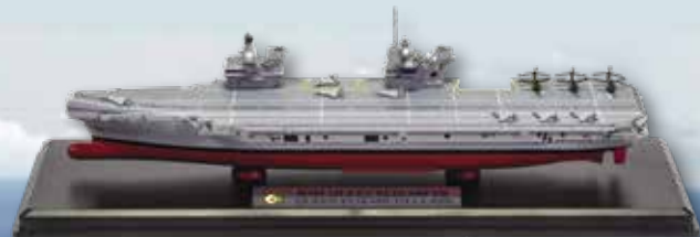
CC75000 HMS Queen Elizabeth (R08) Queen Elizabeth-class aircraft carrier AVAILABLE NOW | Length 224mm | Scale 1:1250