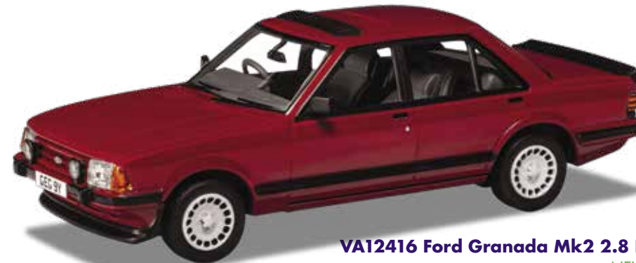
VA12416 Ford Granada Mk2 2.8 Injection Sport Cardinal Red NEW | Length 109mm | Limited Edition

Built by Ford using engines and components supplied by Lotus, the Cortina Mk2 Twin Cam was released in 1967 and saw 4032 examples built in the three years it was available on the market.