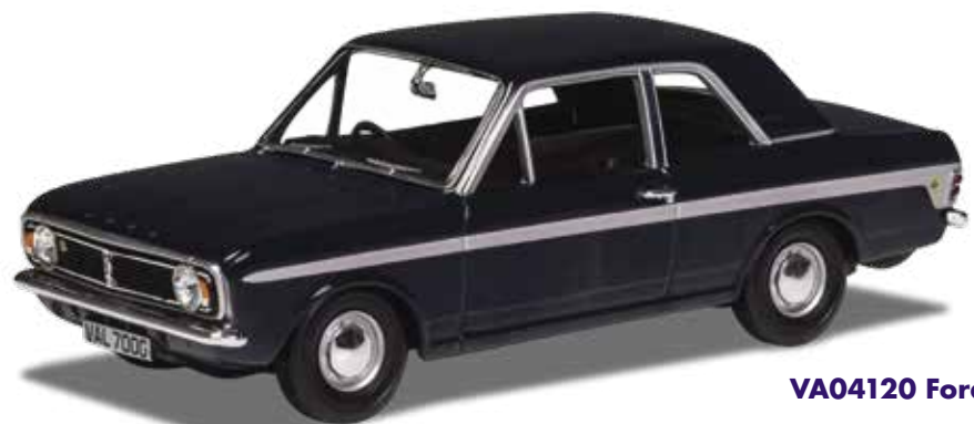
VA04120 Ford Cortina Mk2 Lotus Anchor Blue NEW | Length 103mm | Limited Edition

Built by Ford using engines and components supplied by Lotus, the Cortina Mk2 Twin Cam was released in 1967 and saw 4032 examples built in the three years it was available on the market.