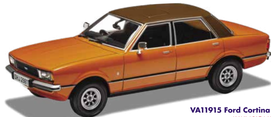
VA11915 Ford Cortina Mk4 2.0 Ghia Signal Orange AVAILABLE NOW | Length 102mm | Limited Edition

A strong seller throughout its lifetime, the Ford Granada Mk2 featured numerous stock engine specifications from the manufacturer, with the most powerful featured aboard this immaculately restored model – the 2.8 litre Injection Sport.