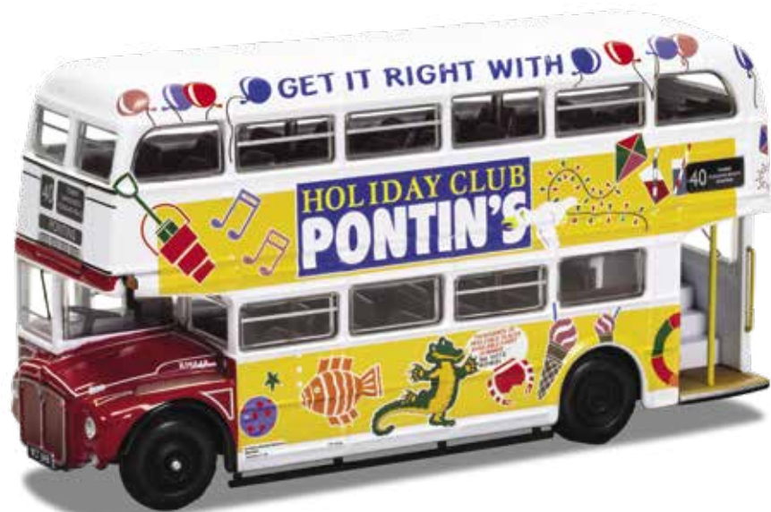
OM46317 AEC RM • Blackpool Transport Pontins