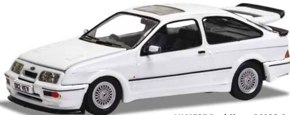
VA11707 Ford Sierra RS500 Cosworth Diamond White NEW | Length 104mm | Limited Edition

The Ford Cortina Mk4 2.0 Ghia was the top model for economy minded company car users of the late 70s and was luxuriously equipped for its era, featuring a wood-veneer dashboard and door cappings among its many perks.