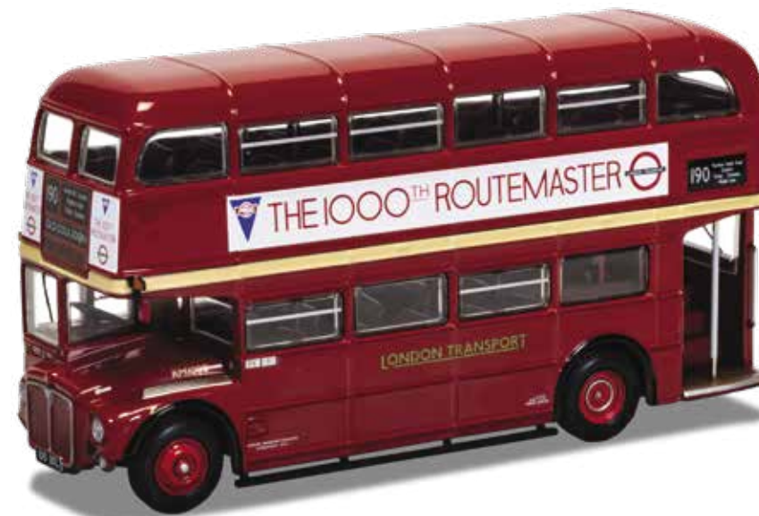
OM46318 AEC Routemaster London Transport 1000 th RM

The backstory, bright and beautiful liveries, special features and statistics of every Original Omnibus are meticulously researched to bring the most accurate 1:76 scale replicas to the market. Each Original Omnibus is secured to a removable display plinth and is presented in a high quality perspex display box. Every model includes a bespoke, individually numbered, limited edition certificate which details the full fascinating history of the bus concerned.